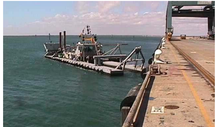
Dredging at Outer Harbor Berth 7

To date, dredging of most of the Outer Harbor Swinging Basin and some of the Outer Harbor Berths has been completed. Dredged material from the Outer Harbor Swinging Basin has been used to fill