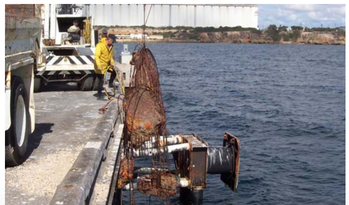
Under wharf steel debris being lifted out by crane