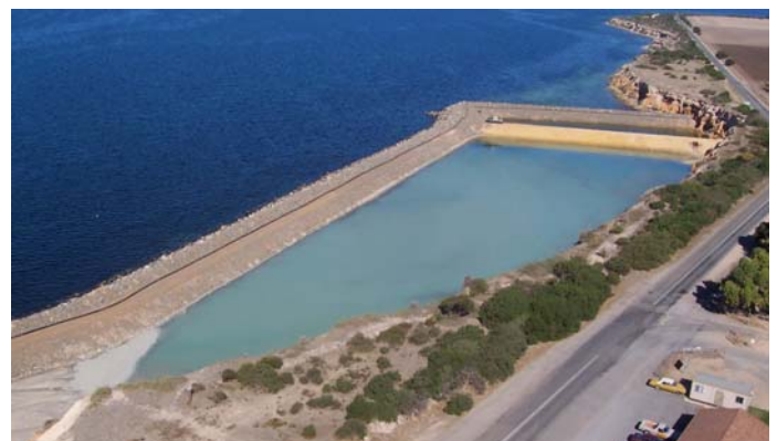
Completed reclamation pond prior to the commencement of dredging