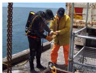
Divers preparing to remove debris from under the wharf prior to dredging

The dredging contractor, Hall Contracting, has now mobilised his cutter suction dredge to Port Giles and has commenced capital dredging of the channel and berth box to accommodate deep draft Panamax vessels. The work is expected to be completed by October 2004.