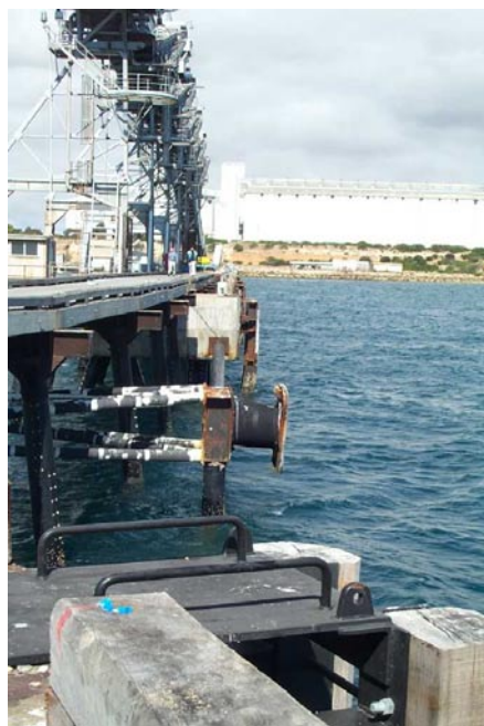
Port Giles Jetty

A development application under the Crown Development process of the SA Development Act, 1993 was submitted in January 2002. This application was sponsored by the then Minister for Administrative and Information Services, The Hon. Dorothy Kotz.