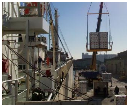
US bound Riversun citrus shipment