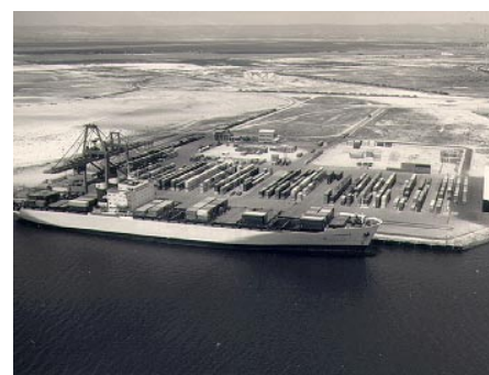
'Ariake' makes it's maiden Adelaide call as part of the ANSCON consortium 1985